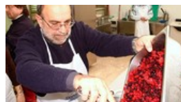
Sweet Dreams at Gelato School