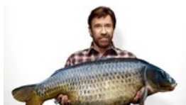
'Brusli?' No. Chuck Norris