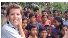
Taking a 'Gap Year' Before College