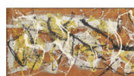
A Retrospective's Tale of Two Cities